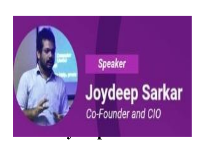
Co-Founder and CIO, Estory Infocom